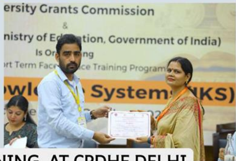
IKS TRAINING AT CPDHE DELHI